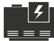
Small Power Generators